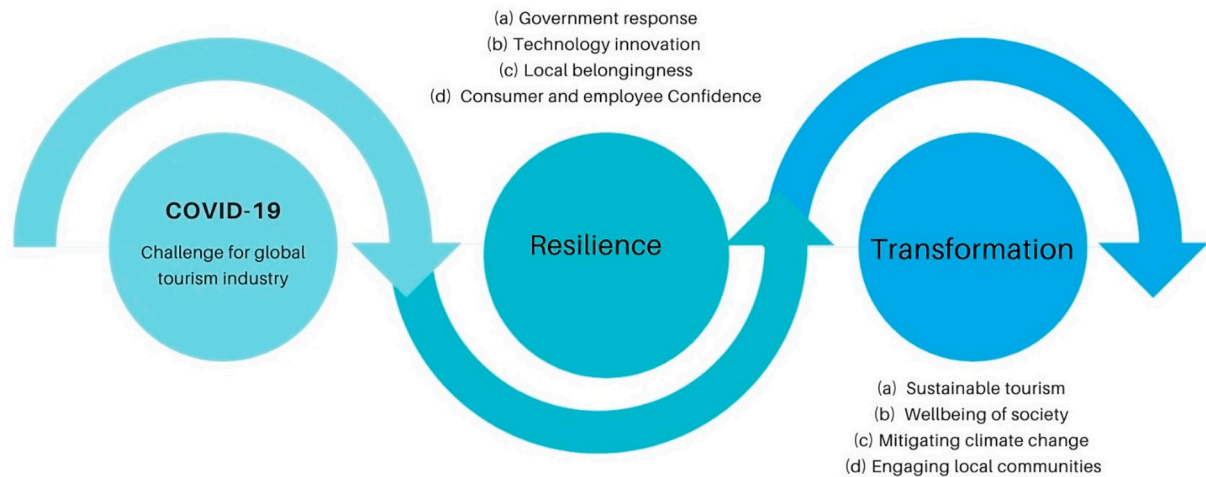
Fig. 3. Resilience-based framework for the new global economic order.

to “non-tourism” at once (Gössling et al., 2020). The increasing unemployment in other sectors of the global economy will also reflect in the number of tourist visits in the coming years. Segments of the tourism industry, including airlines, hospitality, sports events, restaurants, and cruises, are bound to be hammered by the pandemic. The proposed resilience-based framework can help transform the industry both during and after COVID-19.